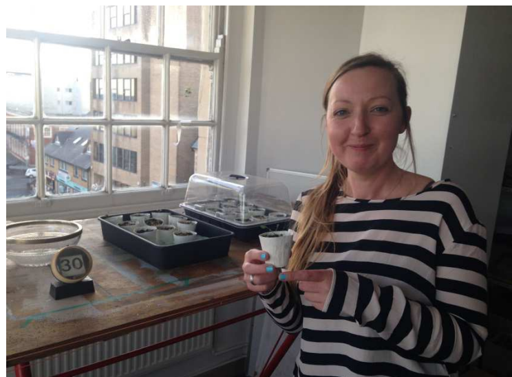
Glynn Vivian Instagram Takeover, 2015